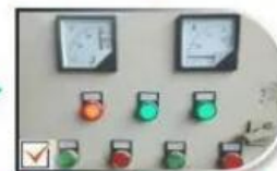
4. Nitrogen Replacement 0.3MPa