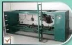
Inner Rust & Polish