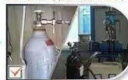
3. Vacuum & Drying 12 hours