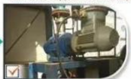
2. Tightness Inspect